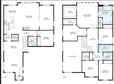
2D Floor Plan $75