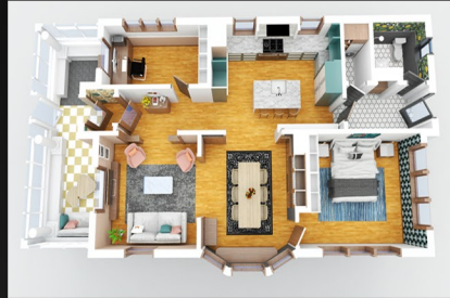
3D Floor Plan $175